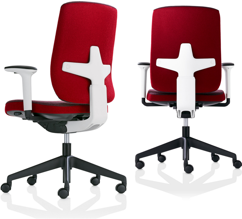
Top – SEREN-HBA, Bottom – SEREN-HBA