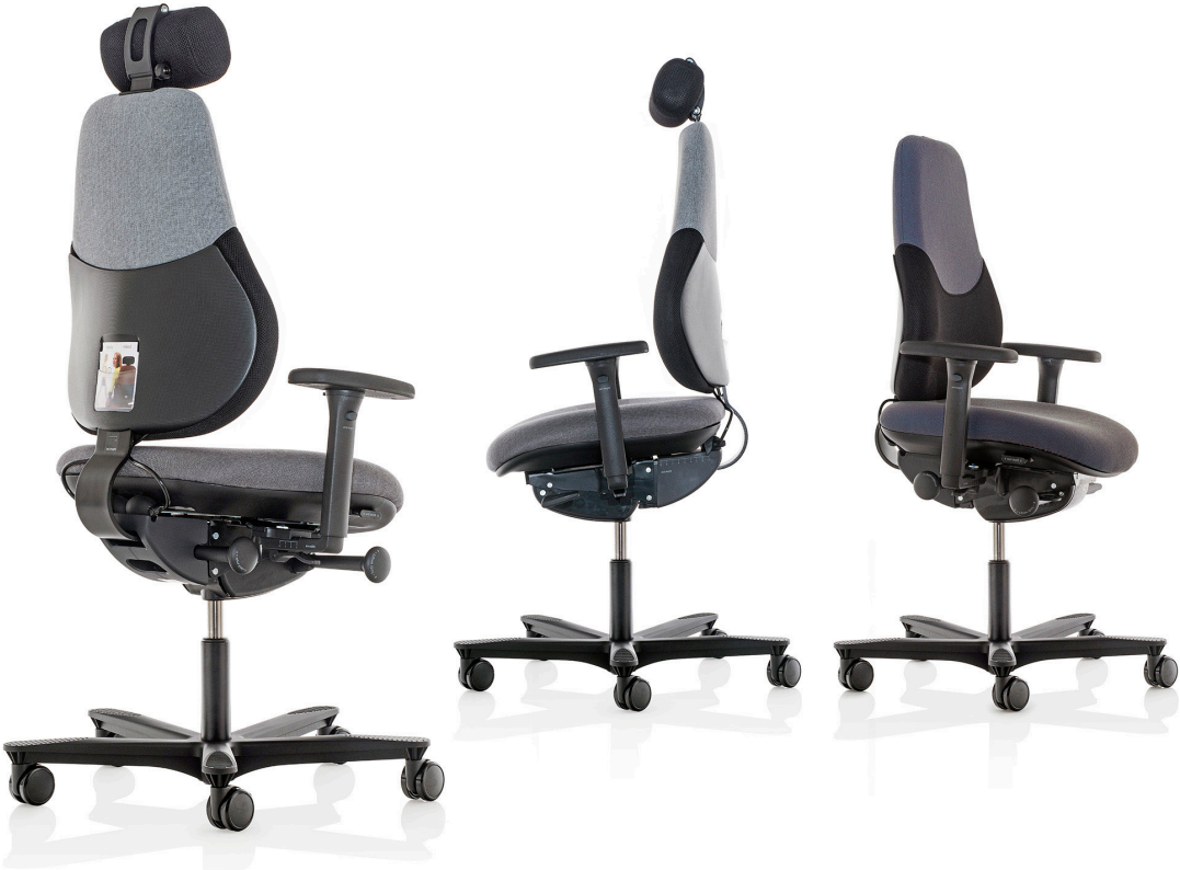
Top – FLO-HBA, Bottom – FLO-HBAH & HBA